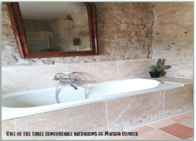
ONE OF THE THREE COMFORTABLE BATHROOMS OF MAISON OLIVIER