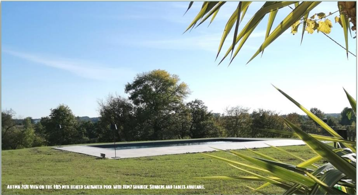
AUTUMN 2020 VIEW ON THE 18x5 MTR HEATED SALTWATER POOL WITH 20M2 SUNDECK. SUNBEDS AND TABLES AVAILABLE.