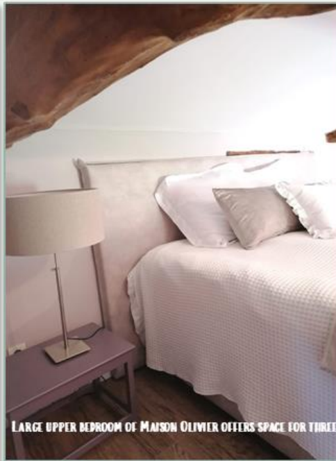
LARGE UPPER BEDROOM OF MAISON OLIVIER OFFERS SPACE FOR THREE